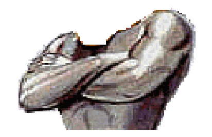
"The Medes & Persians" (5:28; 6:28, 8:20)

Lydia (546 B.C.) – in Asia Minor Babylon (539 B.C.) Egypt (526 B.C.)